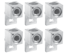
Lug kit (as required)